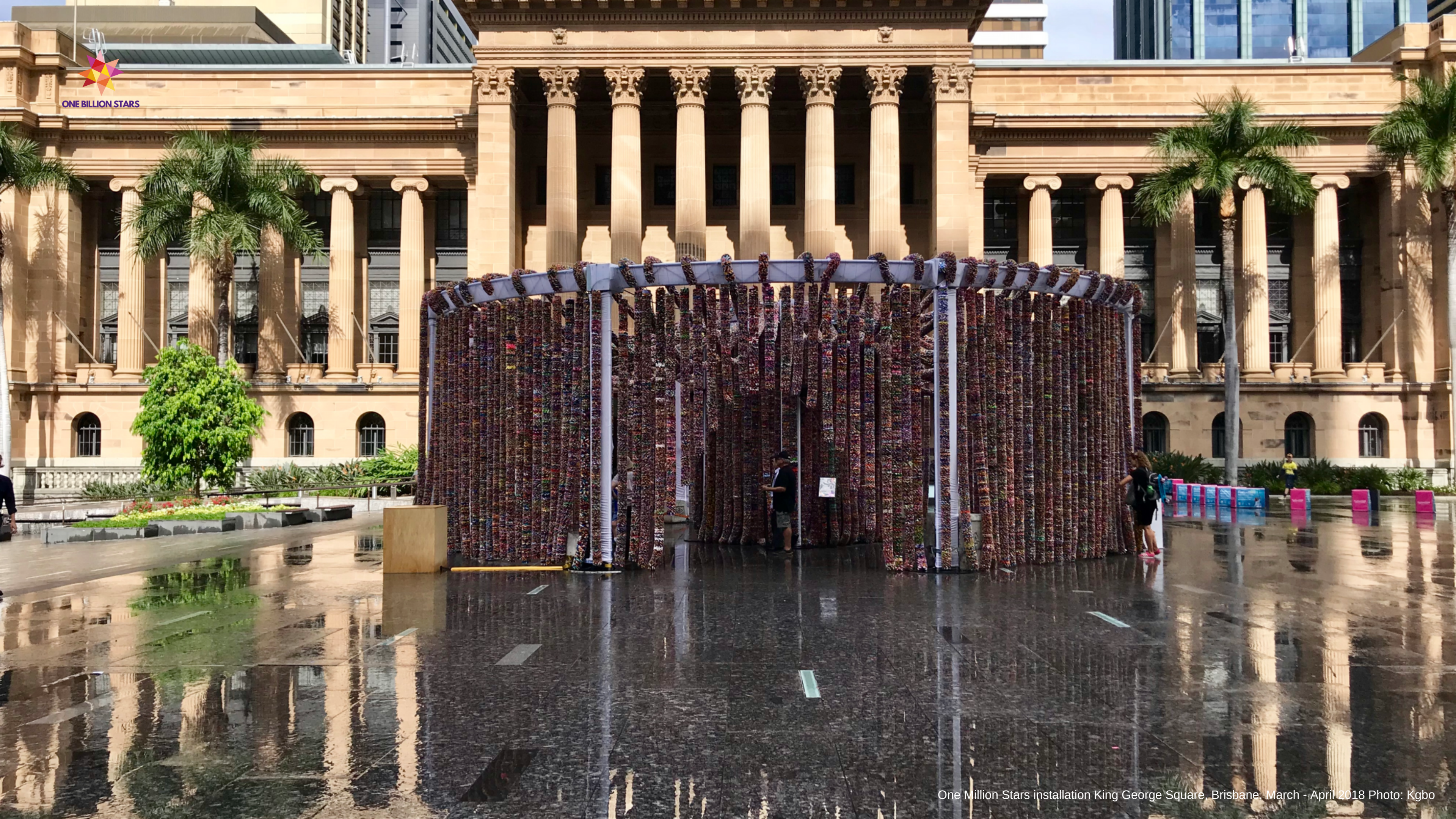
One Million Stars installation King George Square, Brisbane, March - April 2018